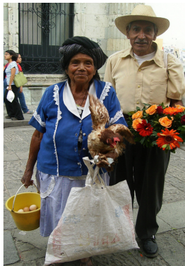
Indigenous couple on their way from the market

There are moments in life when we are called to greatness. We are commanded to abandon our comfort zones, desert our steadfast beliefs and move in the direction of our highest aspirations. Such opportunities appear in the form of obstacles, and if they are endured and mastered, they catapult us to personal transformation.