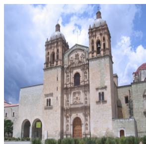
Santo Domingo Church in Oaxaca, Mexico

293 for Oaxaca, Mexico. The first leg of the voyage was uneventful until we arrived in Mexico City. Suddenly, all signs and announcements were in Spanish with English subtitles. Not a word of English emanated from the vocal cords of anyone. My brain made an instantaneous paradigm shift in order to incorporate each nuance. Every phrase, vowel, conjugated verb, and consonant learned in class reverberated against my cranium. And this was only the beginning!