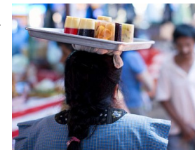
Woman walking down the street

The most important person in my life was my Mother. Through all adversity there was always a smile. A smile only a mother can give, one of love, nurturing, and care. When the season of Fall approached, the aroma of apple pie permeated the house and as one entered there was that smile of love and compassion.